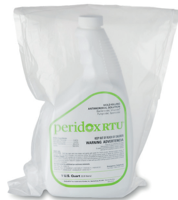
All bottles are sealed in plastic.

Complete efficacy data available for download at healthcare.contecinc.com .