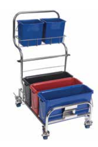
Compact Triple Bucket System with Utility handle (2940U3B)

Trolley 63.5 (L) × 49.0 (W) × 104cm (H) 15L Bucket 15.3 (L) × 47.6 (W) × 25cm (H) 6L Bucket 15.3 (L) × 22.2 (W) × 23cm (H)