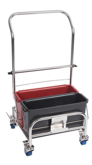
Trolley 44.5 (L) x 49.0 (W) x 104cm (H) 15L Bucket 15.3 (L) x 47.6 (W) x 25cm (H)

Compact Double Bucket System with Standard handle (2940P2B)