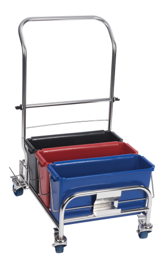
Trolley 63.5 (L) x 49.0 (W) x 104cm (H) 15L Bucket 15.3 (L) x 47.6 (W) x 25cm (H)

Compact Triple Bucket System with Standard handle (2940P3B)