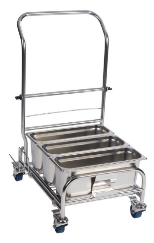
Trolley 63.5 (L) x 49.0 (W) x 104cm (H) 10L Bucket 17.0 (L) x 49.0 (W) x 20cm (H)

Compact Triple Bucket System with Standard handle (2940P3S)