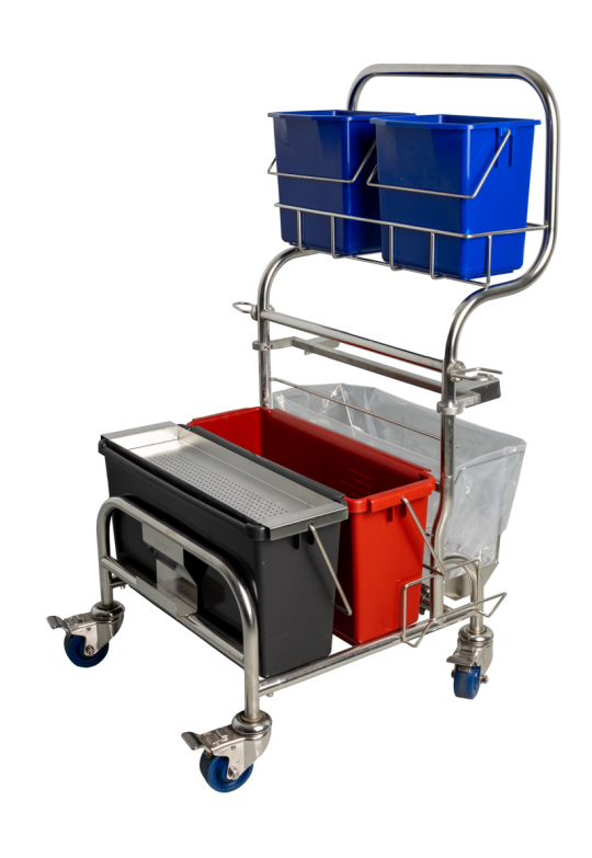
Mop Saturation System with polypropylene buckets (2941U2D)

A convenient clip and holder for the mop frame and handle when it is not in use, are also fixed to either side of the cart.