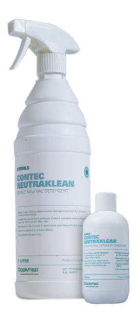
"Ideal for the low level cleaning required in life science cleanrooms"