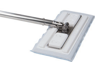
2652LF, HCKM3004, 2725E

NOTE: Due to thermoforming of the plastic backplate, autoclaving of Klean Max is not recommended. All hardware is autoclavable unless otherwise noted.