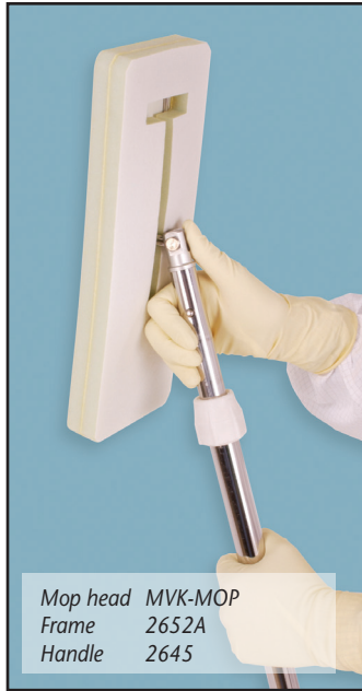
Mop head MVK-MOP Frame 2652A Handle 2645