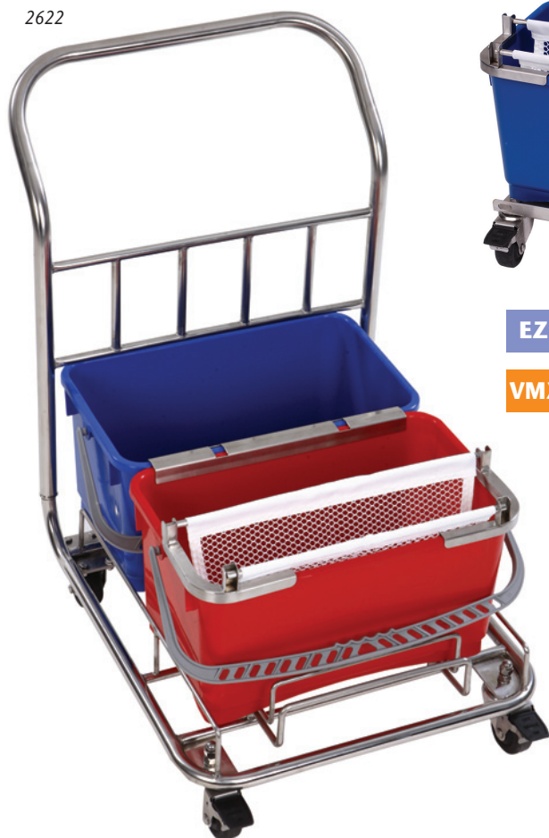
Pictured in photo: 2622 Stainless steel cart, two 6.5 gal (25L) polypropylene buckets (blue, red), connecting kit, Slinger and frame, casters

NOTE: All hardware listed is autoclavable unless otherwise noted.