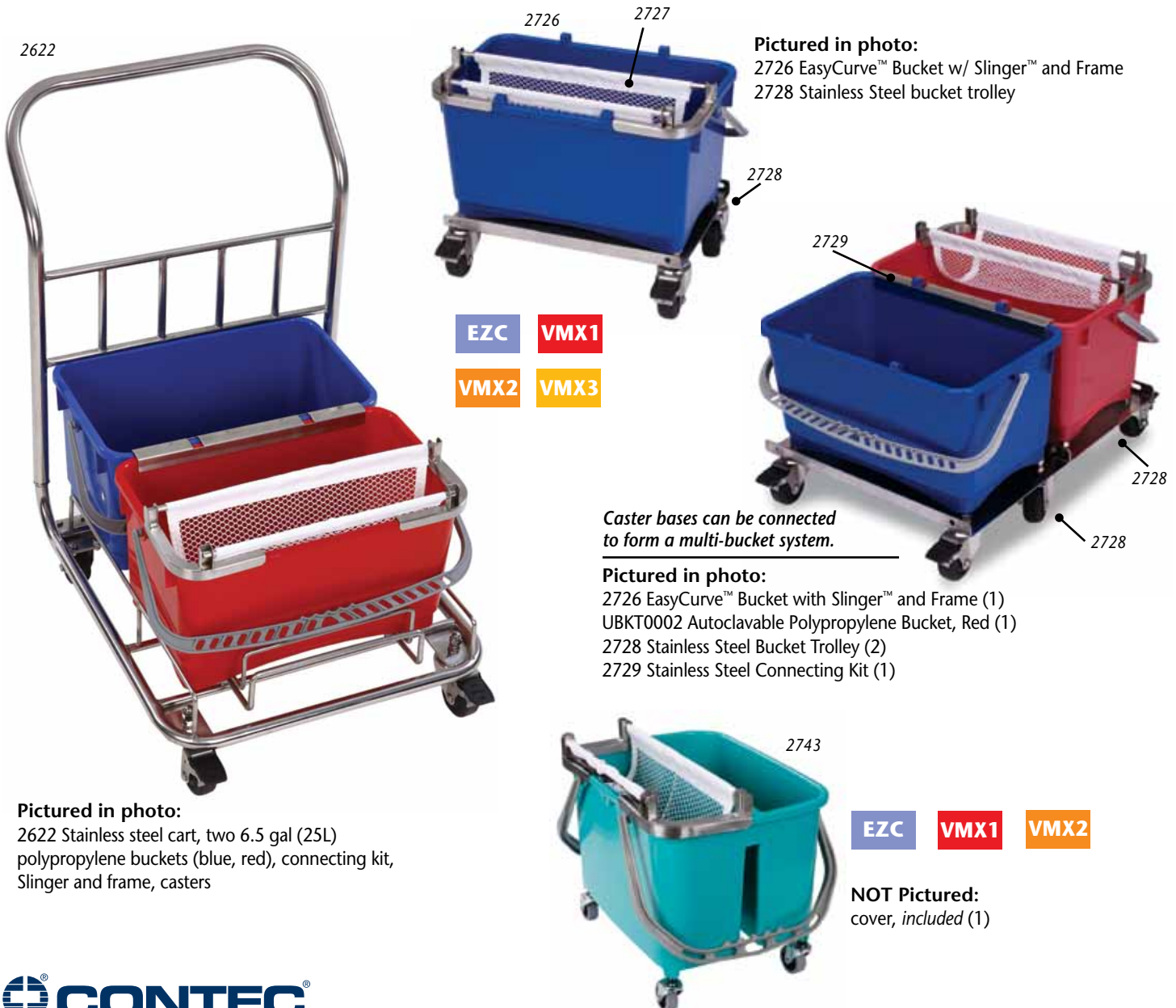
Pictured in photo: 2726 EasyCurve™ Bucket w/ Slinger™ and Frame 2728 Stainless Steel bucket trolley

NOTE: All hardware listed is autoclavable unless otherwise noted.